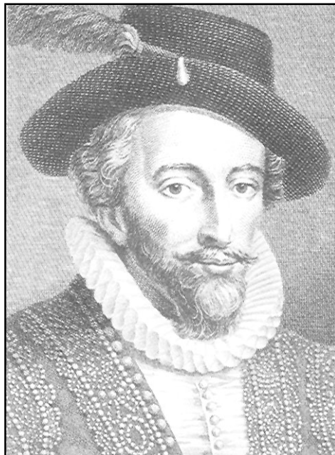
Sir Walter Raleigh